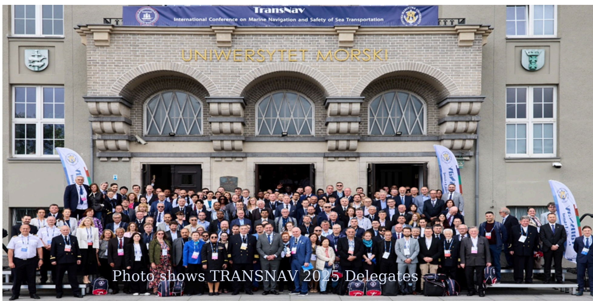
Photo shows TRANSNV 2025 Delegates

The conference was organized by the Faculty of Navigation of Gdynia Maritime University and the Nautical Institute (NI). A broad range of peer-reviewed papers sparked meaningful discussion on important and emerging topics such as Artificial Intelligence (AI), data analysis and cyber security, green shipping and inland navigation, GNSS and offshore technologies, ship routing and maintenance, human factors, MET, and the workload on seafarers. This distinguished global forum brought together maritime professionals and academics from 83 countries, represented by over 200 scientists and professionals from the maritime industry. TRANSNV provided a unique platform for interdisciplinary dialogue regarding the current and future landscape of maritime navigation.